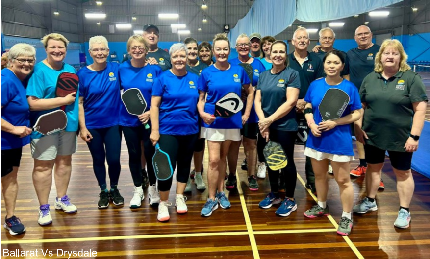
Ballarat Vs Drysdale